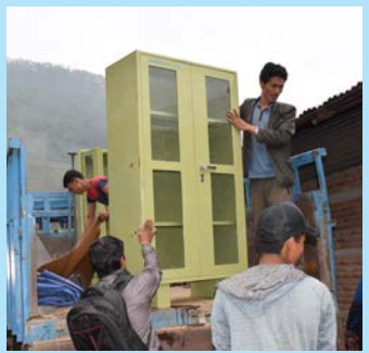
Shree Kyablungthan Basiac School