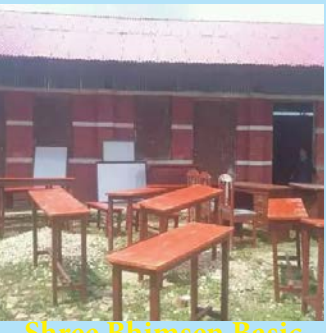
Shree Bhimsen Basic School