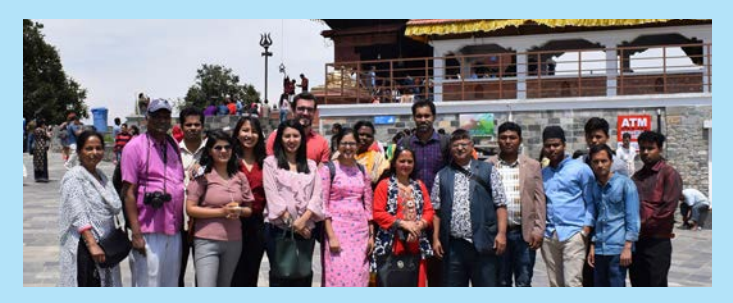
Handover of Shree Tulasi Basic and Shree Bhuwaneshowri Basic Schools