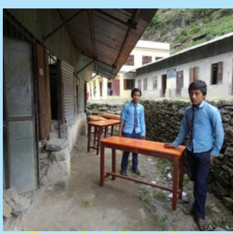
Shree Seti Devi Basic