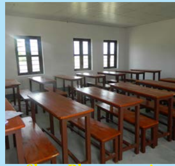
Shree Bhumeswori Basic School

NJSI has been fulfilling the standard of the government schools through various activities such as construction of classrooms, training programs to teachers, awareness program on some informative knowledge on different topics to the students. Similarly, this time NJSI equipped four different schools of Sindhupalchowk with furni-ture as per their need.