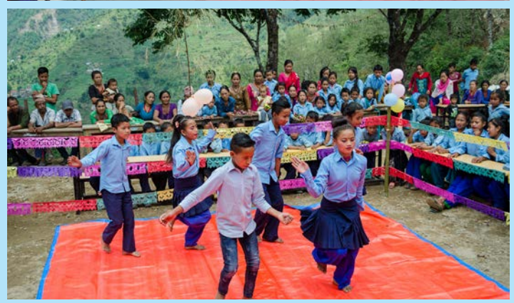
Students performing the dance

The MOU was signed on 24th January 2019 among National Reconstruction Authority, Central Level Planning Implementation Unit and NJSI for the construction of the Shree Bhuwaneswori Basic School. This school is located at Mahabharat Rural Municipality, ward no.5 which is one of the difficult terrains of Kavre district. Within six months of hardship NJSI was able to complete the construction and handed over to the school management committee on 2nd June.