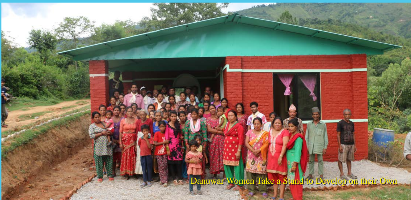
Danuwar Women Take a Stand to Develop on their Own

The much awaited Activity Centre for the women of Danuwar community was completed and handed over at Jaretar in Kavre District. The total population of the Danuwar in Jaretar is 3434. The women group of about 30 organized themselves to support one another and named their group as “Jartar Creative Women’s Community.”