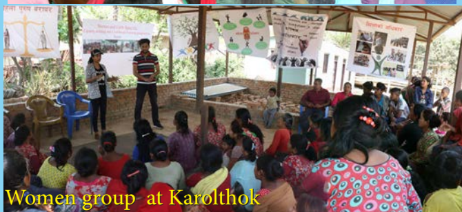
Women group at Karolthok

NJSI has found legal awareness of women in the villages is one of the unreached sector of the society in remote Nepal. In the context of building a new democratic nation para legal training is a timely intervention.