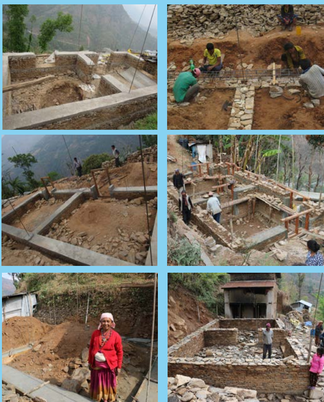
Houses under construction in Gyalthum Sindhupalchowk