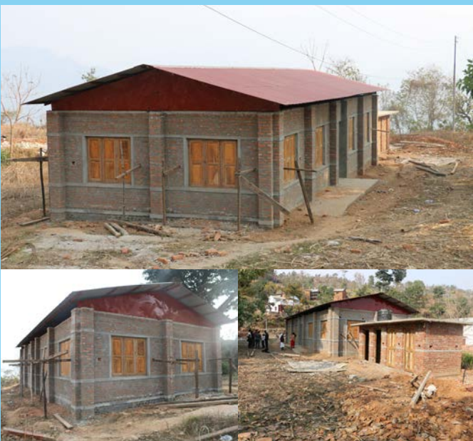
Hostel at Bhairavi School

Most of the construction work has been completed for the three hostels in Nuwakot. The general design of the buildings include separate living rooms for girls and boys, a kitchen, a study room, two toilets and two bathrooms. NJSI expect to handover the buildings to the beneficiaries in two weeks.