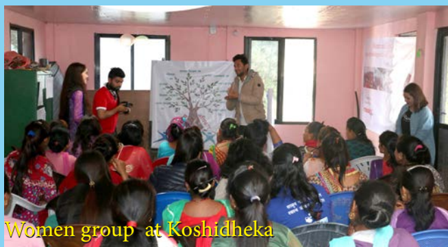
Women group at Koshidheka