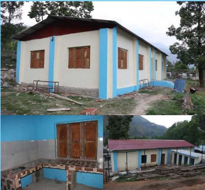
Hostel at Chandeshowri School

Most of the construction work has been completed for the three hostels in Nuwakot. The general design of the buildings include separate living rooms for girls and boys, a kitchen, a study room, two toilets and two bathrooms. NJSI expect to handover the buildings to the beneficiaries in two weeks.