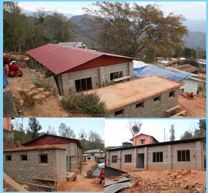
Hostel at Bageshowri School

The hostel at Bhairavi school is also in need of a fence around it to protect the children while Bhageshowri is in need of a retaining wall behind from possible soil erosion.