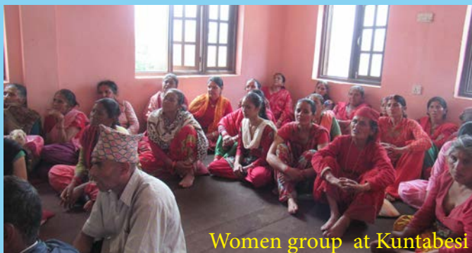
Women group at Kuntabesi

As part of the women and girls specific activities in the earthquake affected areas, NJSI has conducted para legal training and women rights awareness program at three locations in Kavre districts. The women who participated in the training expressed that they learned a lot of things which they did not know. More than 90 women participated from the three VDCs. A summary of the constitutional rights of women in Nepal was explained to them with visuals.