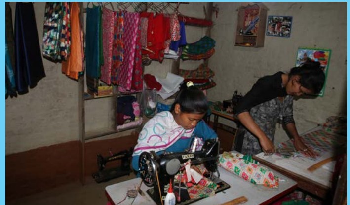
Opened a Tailoring Shop