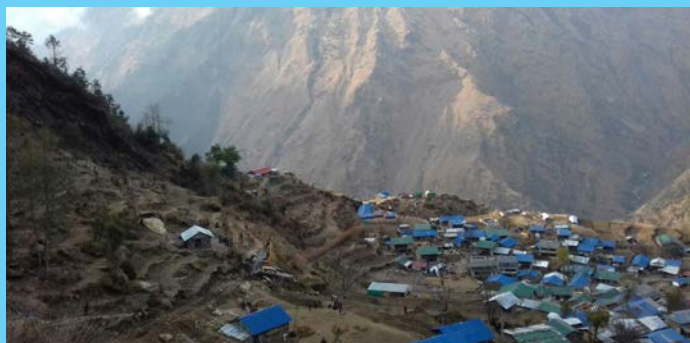
The road reached to Tipling Village

The first phase of the road construction has been completed, now the work of widening and clearing the road going on. The people are really excited and happy to see the road in their village. Numerous hopes are attached to this road as it is the first step towards development of the people and the place.