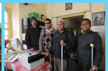
2 scanners to BSS