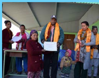
Tamang Community Appreciation certificates from 2 Schools