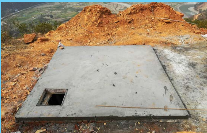
Completion of 18000 Ltrs reservoir tank