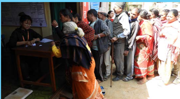
People waiting for their turn

The team treated people simultaneously while teaching the different techniques to figure out the affected body parts and organs. Adding to this, they equipped the people with distinct reflexo therapy which would help for their well being.