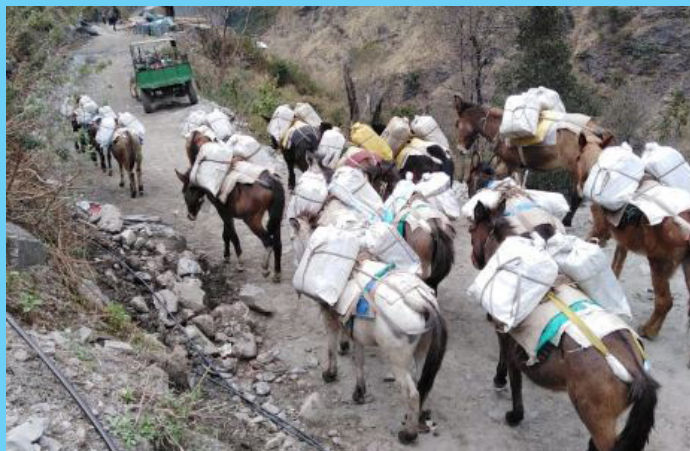
Fuels being transported by Ponies