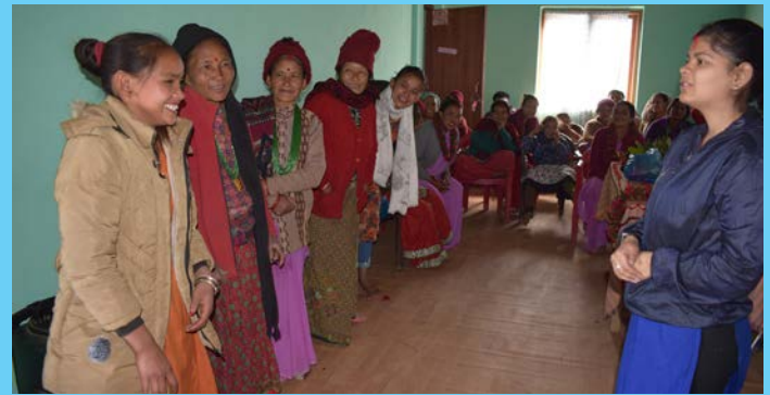
women participating in the activities