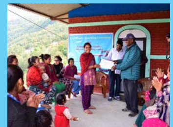
Surel Community Appreciation certificates from 2 Schools