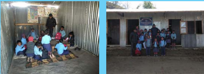
Students studying in TLC