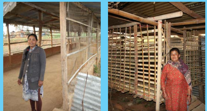
Prepared the shelter for their animals

NJSI has supported financially to 26 women of Danuwar community at Jaretar, Kavre. NJSI assisted these women in order to start up their own business independently. There are five different groups in which one group consisting 4 members have started the tailoring business, they have opened a shop in the community itself. These girls are the one who received tailoring training from NJSI few months ago. Now, they have built their confidence enough to stand financially independent. Another group consisting 5 members have started their "poultry farm" and other three groups consisting six members in each have started with their "goat rearing". All the groups have built the shelter for their animals. After a few months they are expected to be flourishing in their business. The main motive of this program is to make women economically independent. Along with this, soon NJSI is going to give them a training program according to their needs in the respective field. These training programs would help them to learn systematic techniques and methods with an idea how to reach to the product in the market.