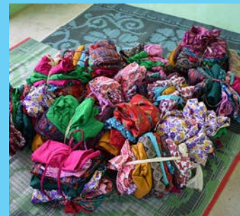
Stitched clothes prepared by the beneficiaries during the training session

Two women groups in Suri, Dolakha have acquired the tailoring training. On 25th Feb, the graduation ceremony was conducted.