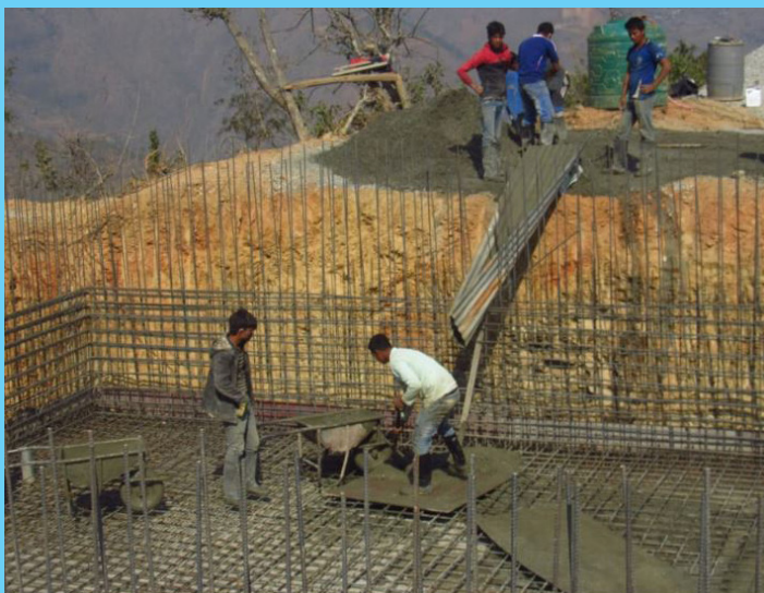
Starting of 200000 Ltrs reservoir tank

One of the sectors that NJSI has been involved for the well-being of the rural population is “WASH”. And one of the districts that NJSI has been greatly involved in after the earthquake is “Ramechhap”. This district is located in rain shadow range creating an extremely arid environment due to which the people have to scuffle for water.