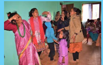
Dance performances by women and girls

On the auspicious occasion of Women's Day, on 8th March, NJSI celebrated Women's Day with the women's group named "Nayagaun Samudayik Sanstha" at Tinkanya, Sindhuli.