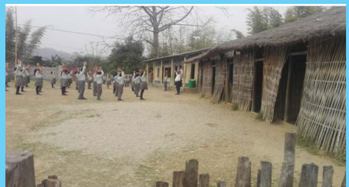
Students studying in temporary shelter made up of straw