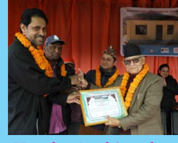
Hostel at Azad Seondary School