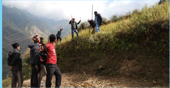
Marking the excat spot in the village from which the track will pass by

The road to Tipling is now, just 7 Kms away from the village. The villagers are very excited and eagerly waiting for the road. Recently, on 12th November, NJSI team went to Tipling to monitor and verify the work that has been done so far. After reaching the village, NJSI team interacted with the beneficiaries and team verified the exact places in the villages from where the road would pass by