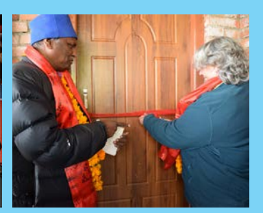
Women's Center at Haibugh