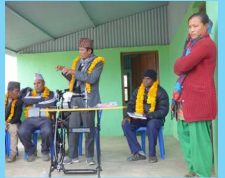
Inaguration of Tailoring Training for 2 groups, Surel and Tamang Community at Suri, Dolakha