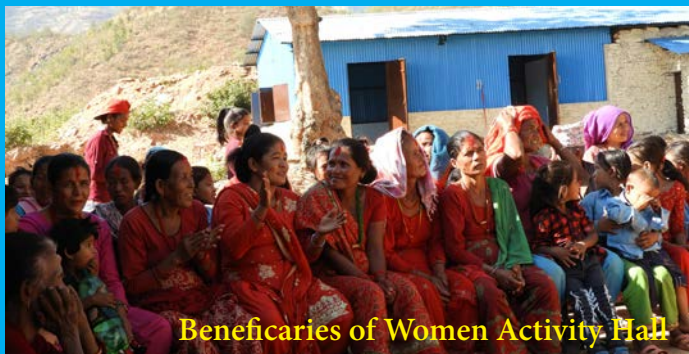
Beneficiaries of Women Activity Hall

As part of the upliftment program for the women of Ramechhap, NJSI has completed the construction of the women activity center.