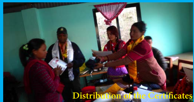
Distribution of the Certificates