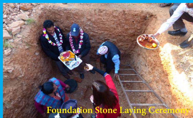
Foundation Stone Laying Ceremony

Mahendra Ratna School's building was collapsed due to earthquake of 2015. Now, the students are studying in the temporary classrooms made up of tin sheets. So, with the help of Caritas Germany NJSI is constructing a two storey concrete building with four rooms. The delay of the construction was due to two reasons: primarily the approval of the building design took a long process and secondly the road was blocked due to the monsoon rains which flooded the river that had no bridge.